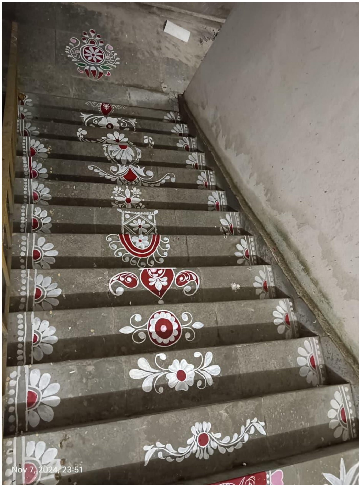
|| Various Art work in hostel premises