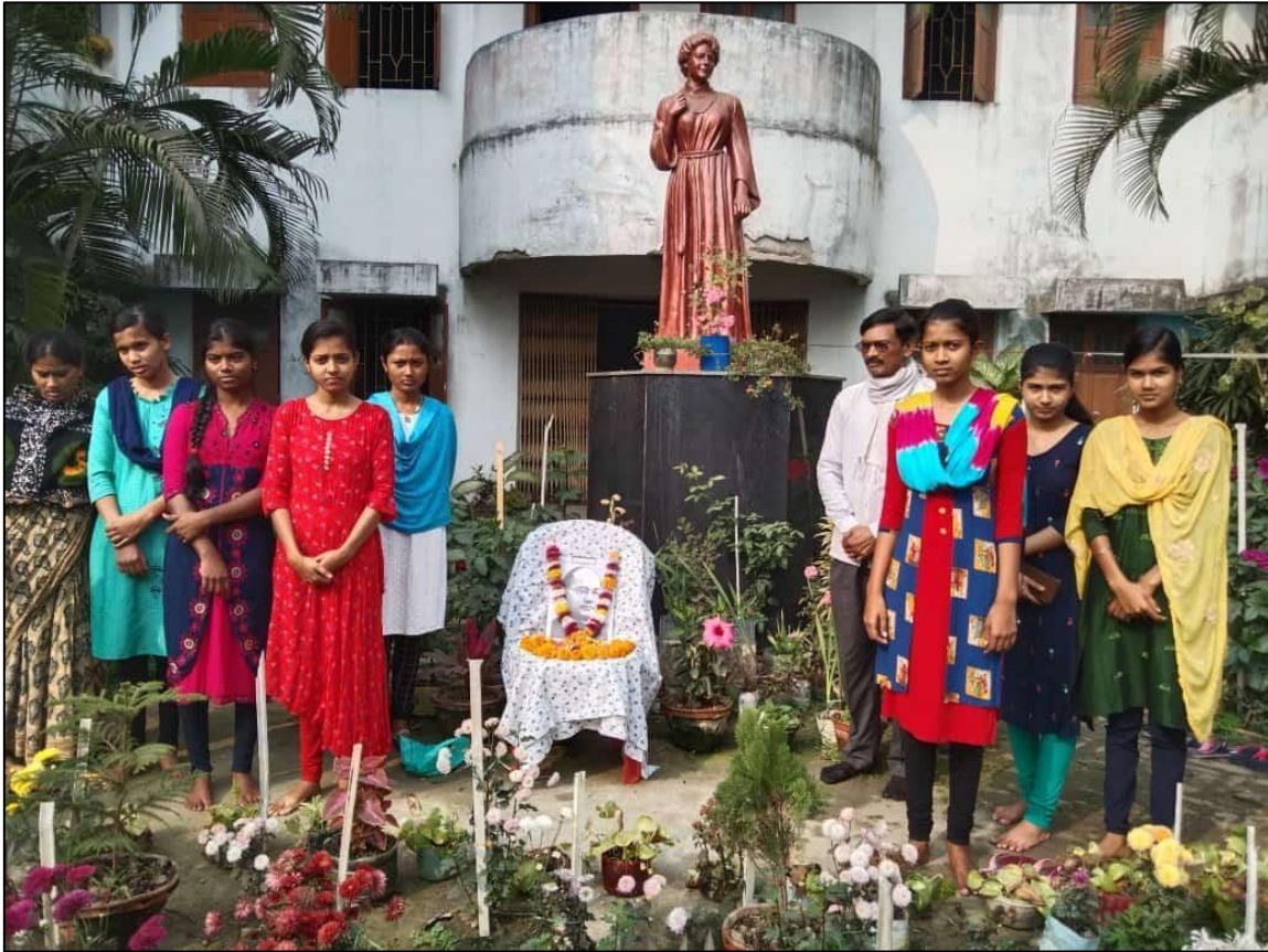
Our Girls, Our Strength