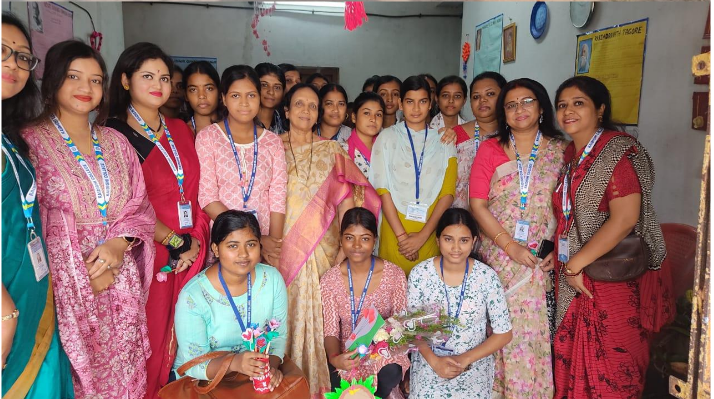
NAAC Peer Team Visiting at Hostel Premises